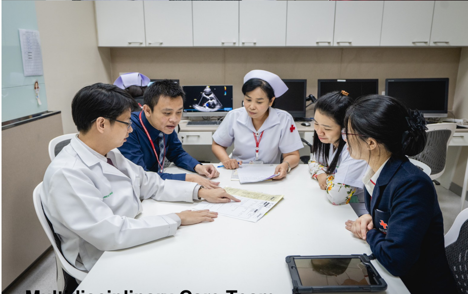
Multidisciplinary Care Team